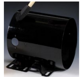
CP2000 seals thermal spray on motor housing.