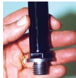
CP2000 seals thermal spray on small heater.