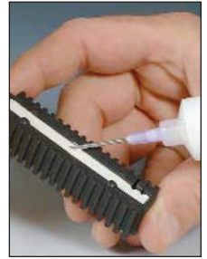
Ceramacast™ 586 pots high power resistor.