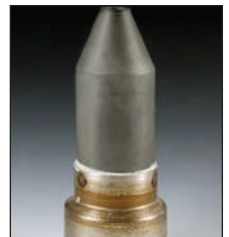
Ceramacast™ 673-N bonds SiC combustion nozzle.