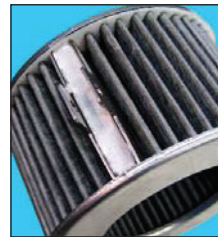
Ceramacast™ 586 assembles high temp filter.