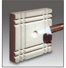
Ceramacast™ 645-N fixture resists propane torch.