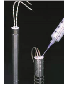
Ceramacast™ 586 pots ignitor and cartridge heater.