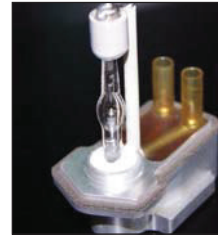
Ceramacast™ 575-N bonds Xenon arc lamp.