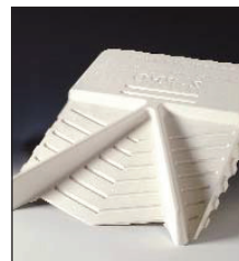
Ceramacast™ 586 molded part.