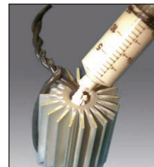
Ceramacast™ 575-N seals arctic heater.