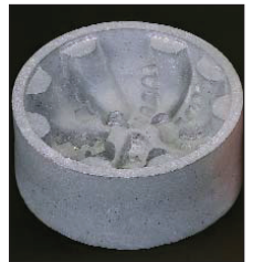
Ceramacast™ 673 mold for down-hole drill bit.